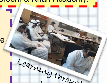
Learning through VR

Lead maths teacher for grade 11 and 12 and homeroom teacher grade 12. I design and deliver maths lessons around problem solving scenarios which enable pupils to develop and further specific mathematical skills in relation to the AERO standards. Pupils then demonstrate these skills through the use of Kahn Academy and topic based work which enables them to implement mathematical skills in everyday situation.